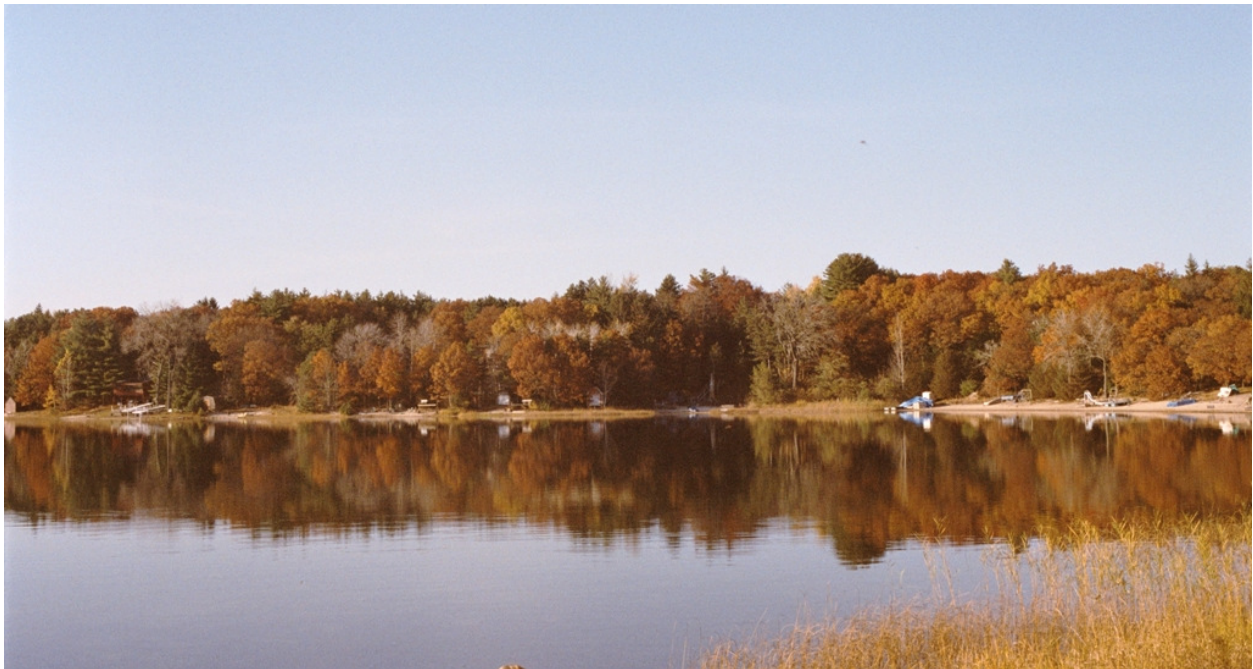
2008 Fall Colors on White Lake